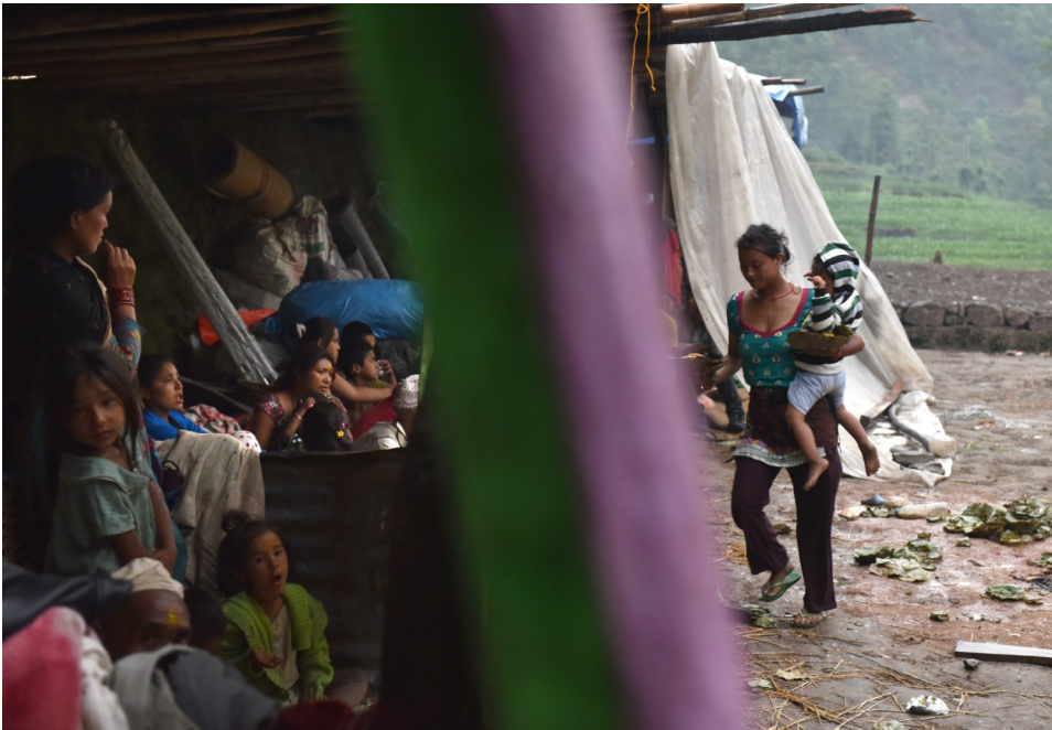
Villagers huddle under a makeshift shack. May 7th, Sindhupalchowk District