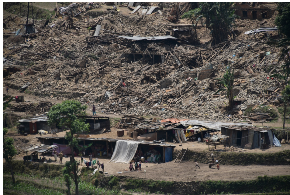
Whole settlements have been destroyed. May 6th, Sindhupalchowk District