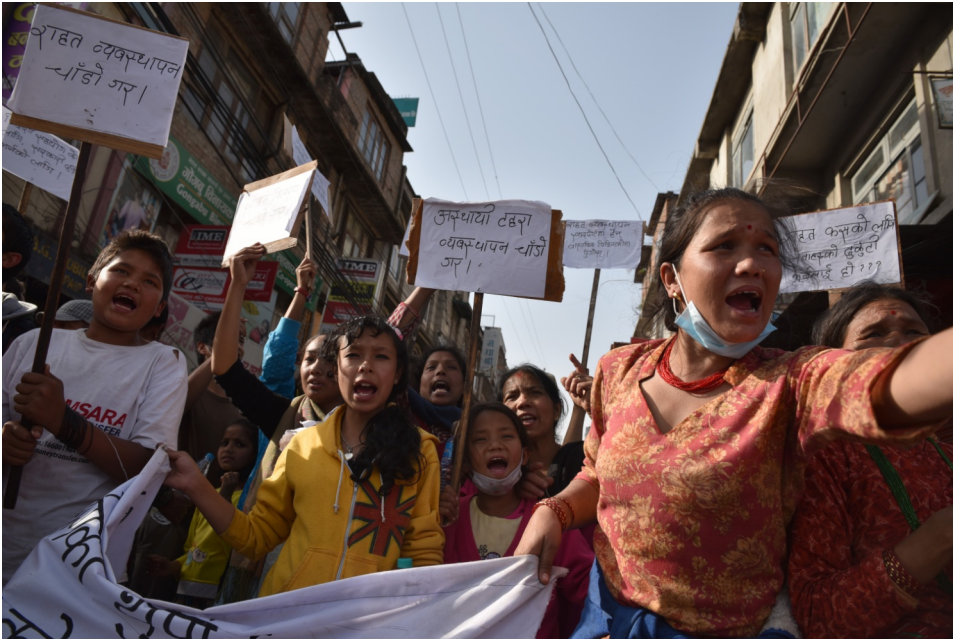
Residents frustrated by the lack of supplies take to the streets. May 1st, Kathmandu