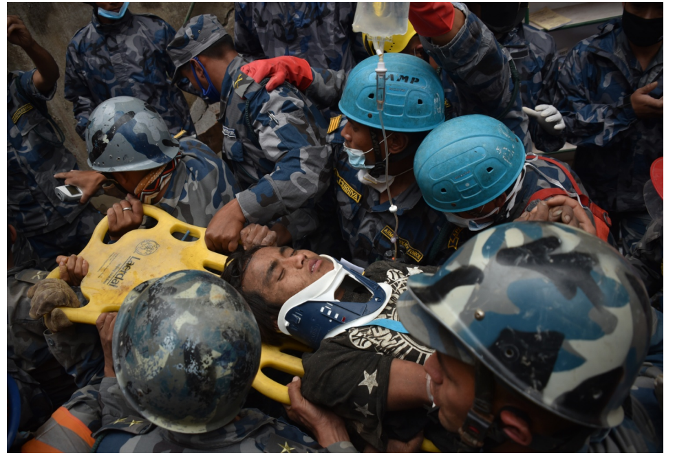
A young man is rescued from the rubble 6 days after the earthquake. April 30th, Kathmandu