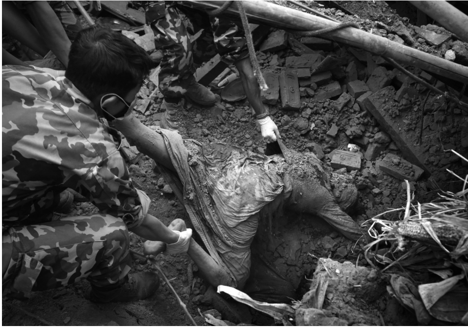
A body is retrieved from the ruins of a house. April 29th, Bhaktapur