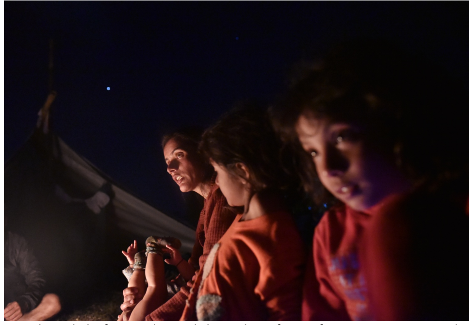
Residents light fires and spend the night in front of a tent set up in a park. April 30th, Kathmandu