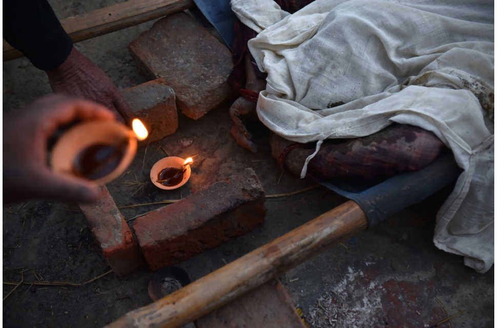
A ceremony is held at a crematorium. April 29th, Bhaktapur