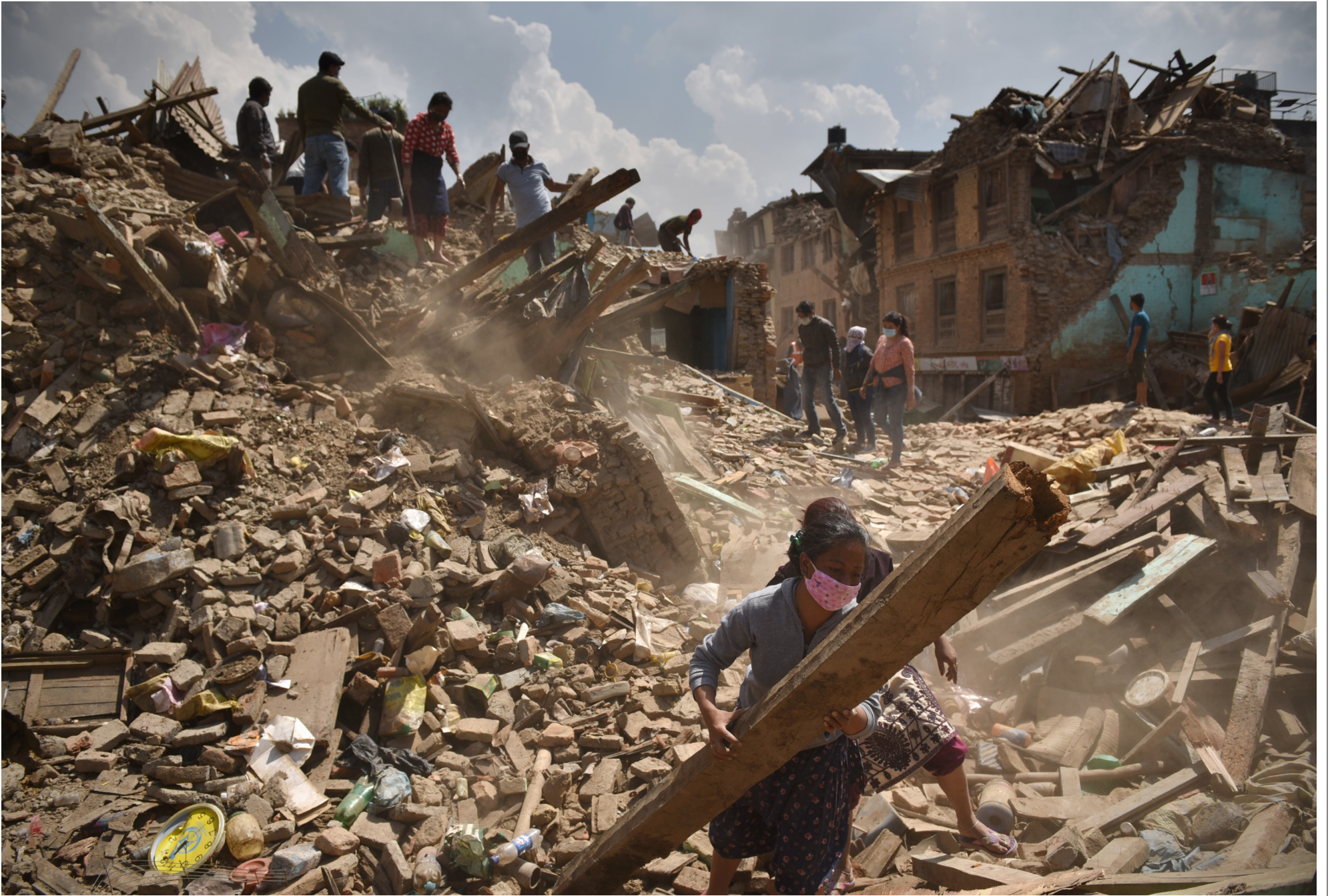
Residents remove debris in the destroyed city. May 2nd, Sankhu